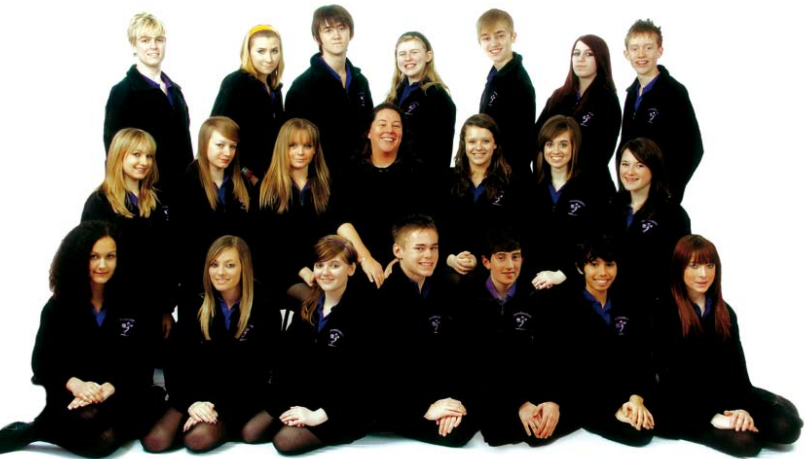
ARABESQUE SCHOOL OF PERFORMING ARTS 2008 ~ 9